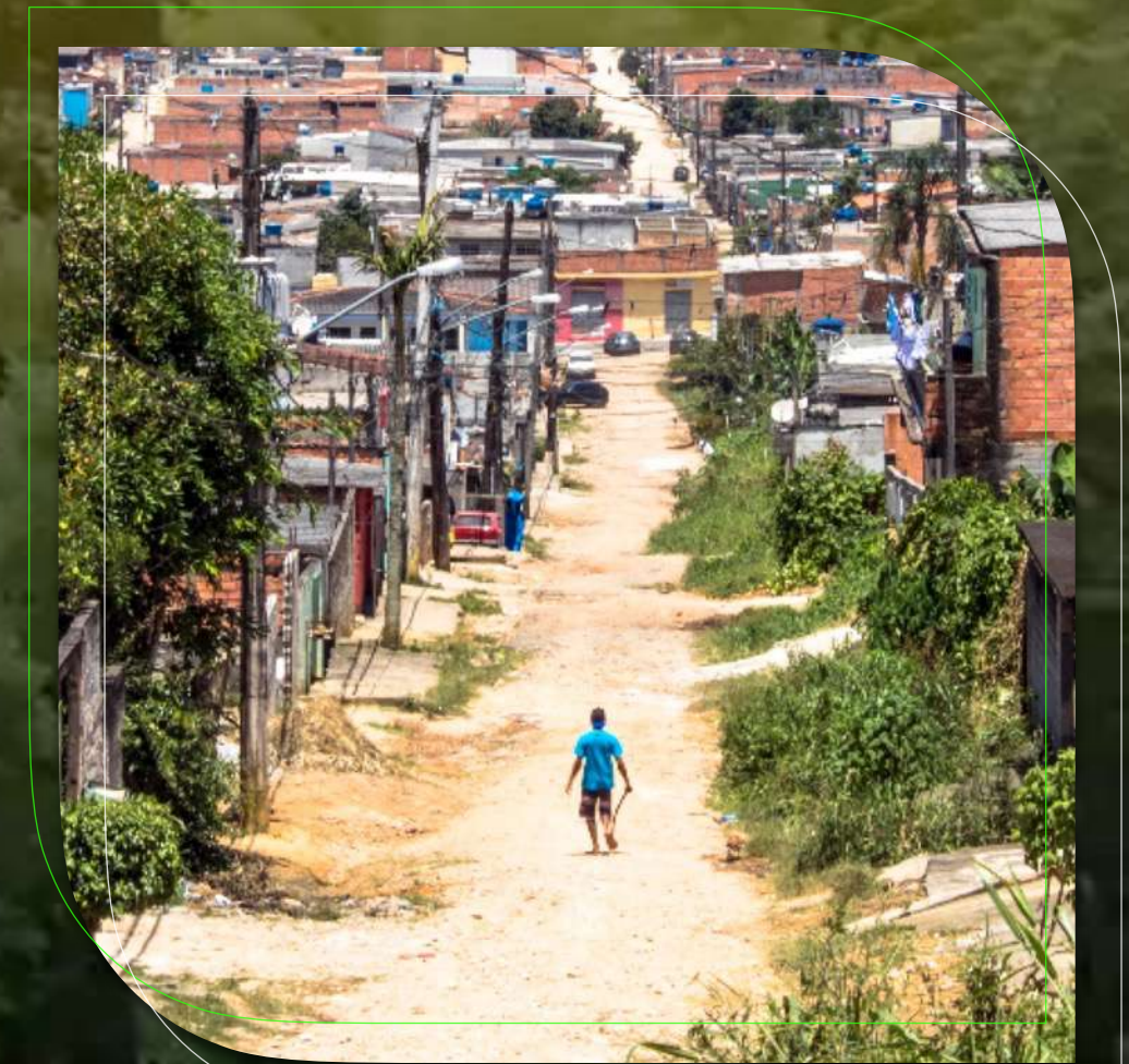
“MAPFRE na Favela”

NET-ZERO ASSET OWNER ALLIANCE: Reduction in greenhouse gas emissions of 43% by 2030